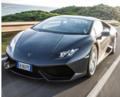
Lamborghini Huracan Coupe & Spider