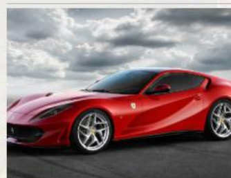
Ferrari 812 Superfast