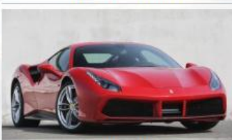
Ferrari 488 GTB Coupé