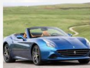
Ferrari California Turbo