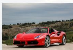
Ferrari 488 GTB Spider