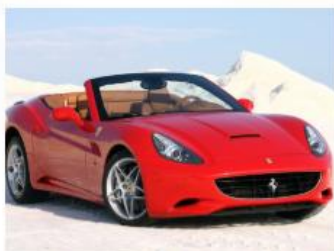
Ferrari California DCT