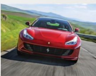
Ferrari GTC4 Lusso