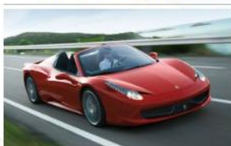
Ferrari 458 Italia Spider