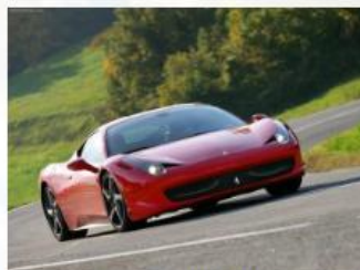
Ferrari 458 Italia